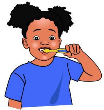
brush your teeth