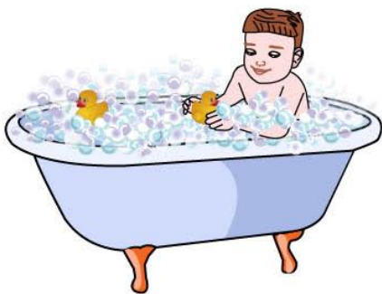
take a bath