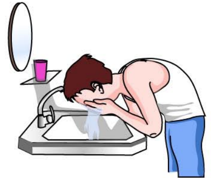
wash your face