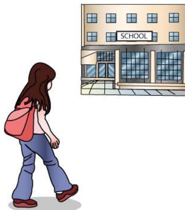
go to school