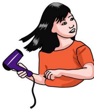
dry your hair