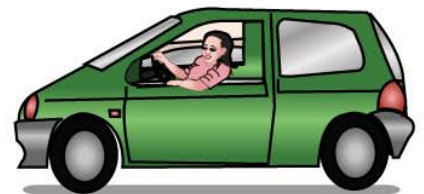
drive to work