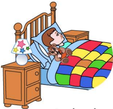
go to bed